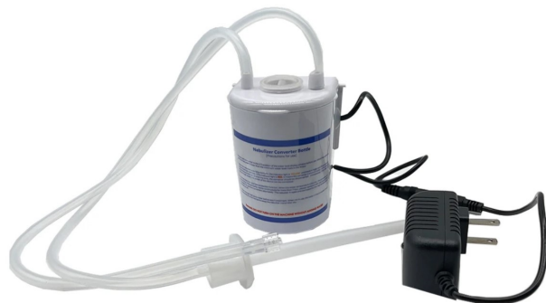
Vaginal Insufflation Kit