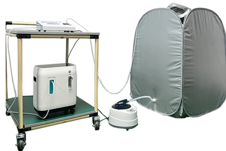
Ozone Sauna Kit