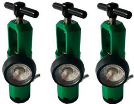
AOT-OR-870 oxygen regulator