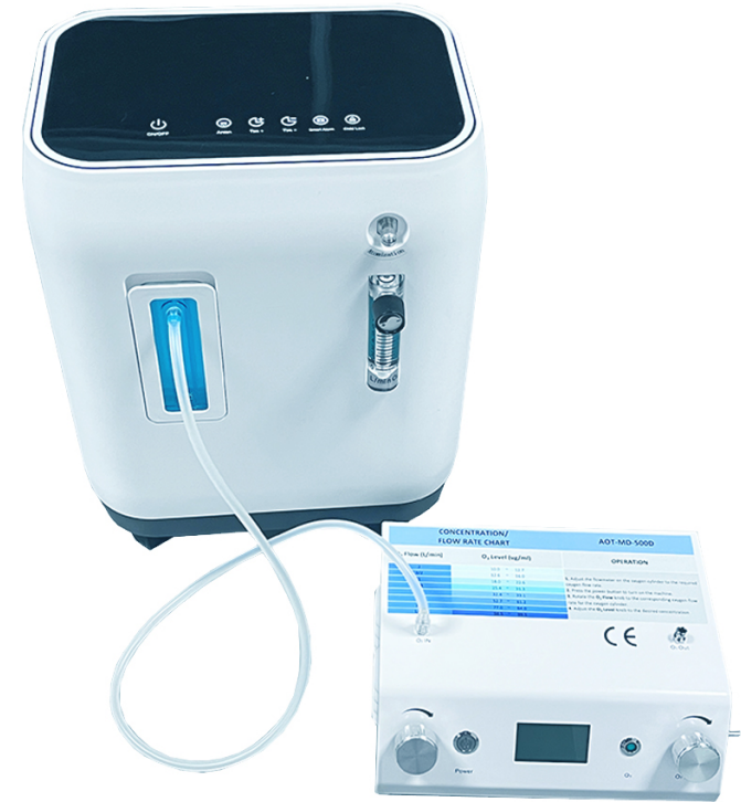
Connect with Oxygen concentrator