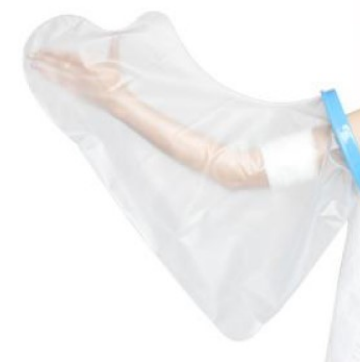
Ozone bag for whole arm