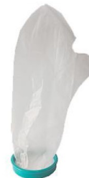
Ozone bag for half arm