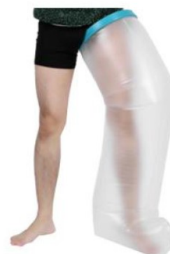
Ozone bag for half leg