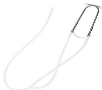
Ozone stethoscope for ear insufflation