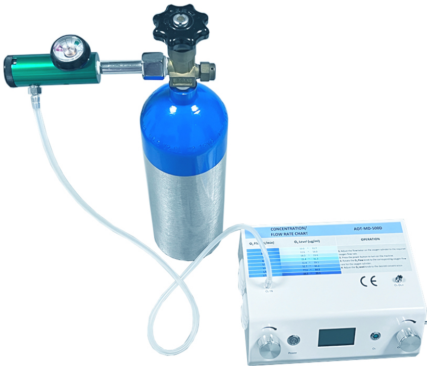
Connect with Oxygen Cylinder

please make sure to operate the medical ozone generator with pure oxygen gas