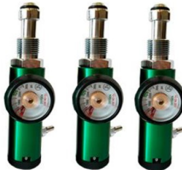
Bull nose oxygen regulator