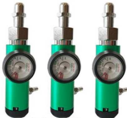
CGA 540 oxygen regulator ( thread 3/4"