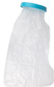
Ozone bag for half leg