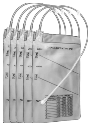
Rectal insufflation bag Volume: 200-400-750ml