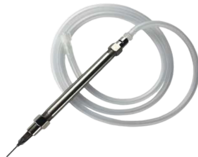
Dental Hand Piece