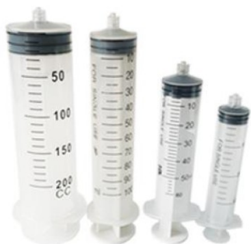
Luer Syringe 30ml-200ml