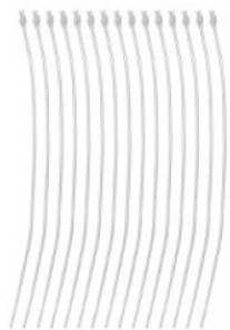
14Fr luer Catheter